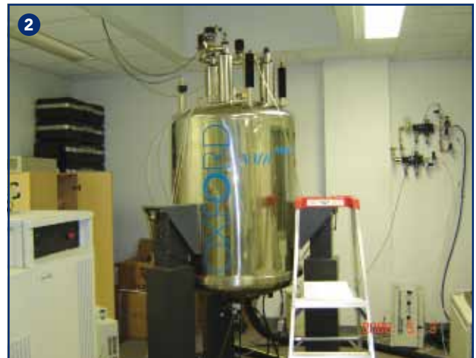
(2) A typical nuclear magnetic resonance machine used in chemistry departments. Note that the machine is vertical with the bore on the top of the machine.

The main magnet is what is typically pictured when showing an image of an MRI system (photo 1). Although two types of magnets are used in MRI machines, the most common one is the superconducting magnet. The donut-shaped magnet consists of a metal tube with approximately several hundred miles of wire windings. Electricity (approximately 400 amps) flows through the wire to produce the magnetic field. Most hospital MRI machines these days are superconducting, which means they are cooled to 4.2° Kelvin (-268° Celsius) by immersing the wire in approximately 1,000 liters of liquid helium. To bring the magnet to the proper field strength, electricity is applied to the windings. There is negligible loss of this electricity, so once the machine is at the desired field strength, it is unplugged from the electricity source. Even though not continually plugged in, an MRI device is always on , so there is always a strong magnetic field