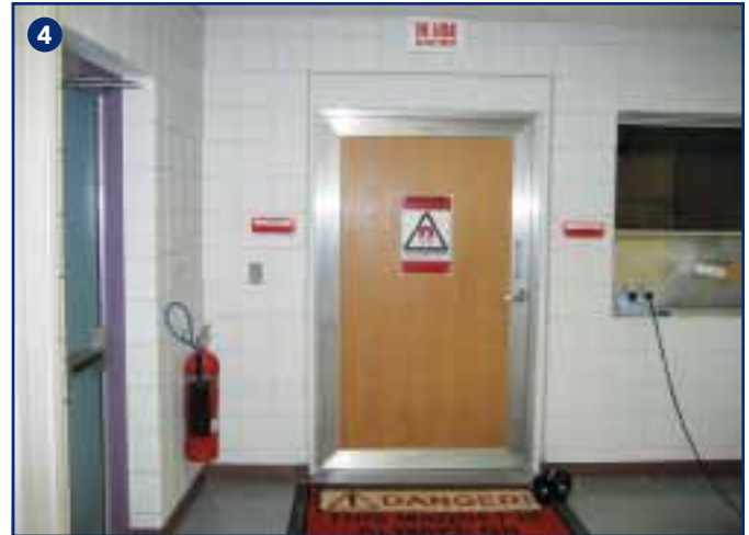
(3, 4) Signs around the entrance to the magnet room. Typically, MRI rooms have signs to warn people entering to be careful, since the magnet is always on. This door is a typical style door that leads into the magnet room. For most MRI scanners, the 5-G line is inside the door, so tools and equipment can be safely brought just to the area outside the door.