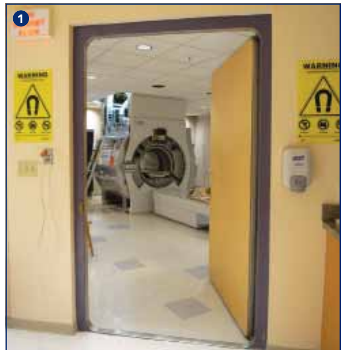
(1) A typical clinical magnetic resonance imaging machine found in a hospital or research facility.

A study reviewed five incidents occurring over a 10-year period in which metal tanks became projectiles when brought into the magnet room. In each case, a hospital staff mem-