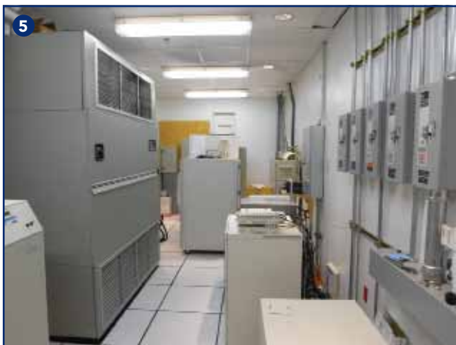
(5) The MRI equipment room contains the four to five cabinets enclosing a computer and other electronics that enable the magnet to create the images. Significant wiring runs between the cabinets and from the cabinets to the room containing the magnet. A large air conditioner is usually present to maintain constant temperature and humidity. The room has an electrical shutoff plunger, possibly near the door, that shuts off the electricity to this room but does not affect the MRI machine's magnetic field. (6) A nonmetallic fire extinguisher is mounted immediately outside the door to the magnet room. In this case, a sign above the extinguisher states that it is safe to carry it into the magnet room at any time. Do not take an extinguisher from the fire apparatus into the magnet room unless facility staff members tell you that it is safe to do so (that is, that the magnet has been quenched).

Do not bring any firefighting equipment, such as metallic fire extinguishers, hoses, halligan bars, axes, and portable radios, into the magnet room prior to quenching the magnet.